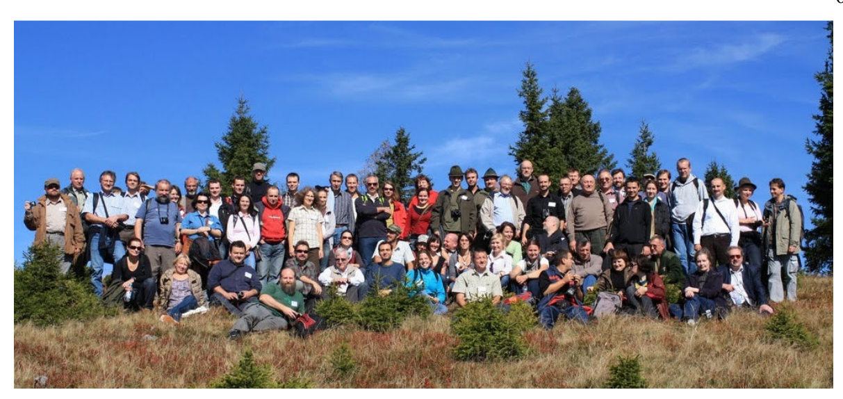
Praticipants of the 9th meeting of IUFRO WG 7.03.10 in Freiburg (Germany), September 2010

The meeting on " Population dynamics, biological control, and integrated management of forest insects " took place from 12-16 September 2010 in Eberswalde, Germany. This was a meeting of the IUFRO working parties 7.03.06 'Integrated management of forest defoliating insects,' 7.03.07 'Population dynamics of forest insects,' and 7.03.13 'Biological control of forest insects and pathogens').