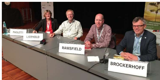
Coordinator & deputies at Div. 7 Conference opening

The last 12 months included a special event for Div. 7 (Forest Health): the first All-Division 7 conference with contributions across all three research groups (Air Pollution and Climate Change, Pathology, and Entomology). Initially this was planned to take place in Istanbul (Turkey), but regrettably we had to relocate the conference due to security concerns at the time. Instead it took place within the 125th Anniversary Congress in Freiburg (Germany) in Sept. 2017. The conference was very successful and attended by ca. 300 Div.-7 delegates. It concluded with a 2-day forest health post-congress tour to the Black Forest (Germany) and Vosges Mountains (France).