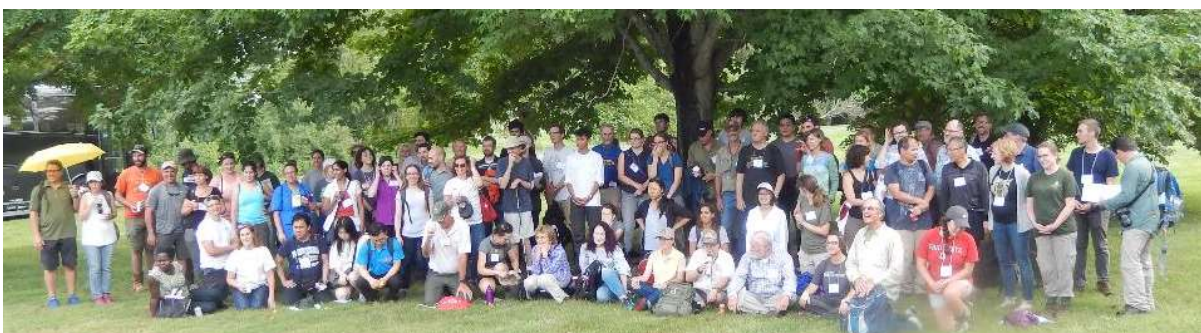
Participants of the “6th International Workshop on the Genetics of Tree-Parasite Interactions - Tree Resistance to Insects and Diseases” in Aug. 2018 in Mt. Sterling, Ohio, USA ( WP 7.03.11 & WP 2.02.15 )