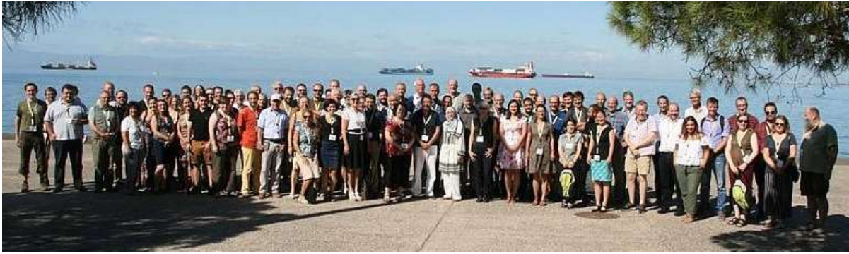
Participants of the conference “Forest Insects and Pathogens in a Changing Environment: Ecology, Monitoring & Genetics” of working parties 7.03.05 and 7.03.10 in Thessaloniki, Greece, September 2017.