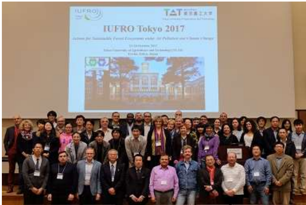
Participants of the 28th IUFRO RG 7.01 conference for Specialists in "Air Pollution and Climate Change Impacts on Forest Ecosystems" in Fuchu, Tokyo, Japan, 22-26 October 2017.

Highlights were the 28th RG 7.01 conference for Specialists in Air Pollution and Climate Change Impacts on Forest Ecosystems in October 2017 in Tokyo, Japan, which was themed "Actions for Sustainable Forest Ecosystems under Air Pollution and Climate Change" (attended by 72 participants from 16 countries), and the "International Conference on Ozone and Plant Ecosystems" (of RG 7.01 , WP 7.01.02 and WP 7.01.05 ) in May 2018 in Florence, Italy. In addition, WP 7.01.03 organised a Session at the General Assembly of the European Geosciences Union in April 2018 in Vienna, Austria.