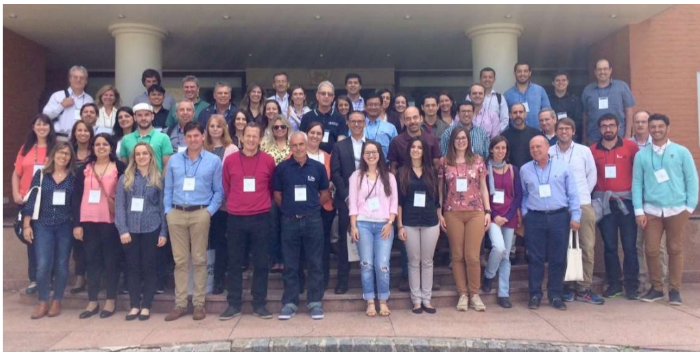
Participants at the ‘Improving Forest Health in Commercial Plantations’ conference, Punta del Este, Uruguay, March 2018, of WP 7.02.13, “Forest Health in Southern Hemisphere Commercial Plantations”.