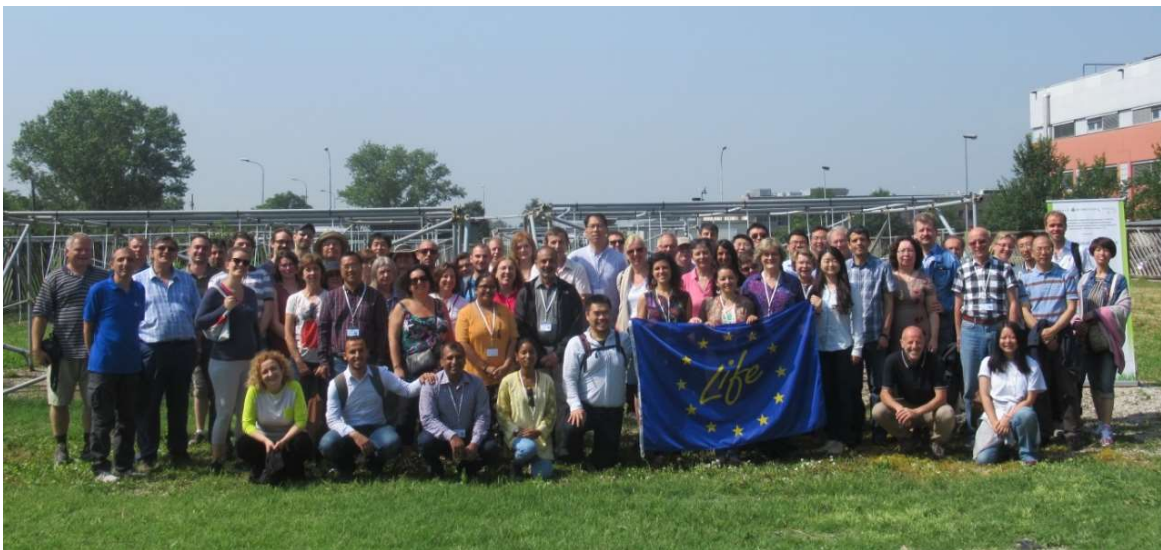
Visit at the ozone FACE facility in Florence, Italy, during the 'International conference on Ozone and Plant Ecosystems', 21-25 May 2018, of RG 7.01 , WP 7.01.02 , WP 7.01.05 .