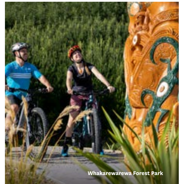
Whakarewarewa Forest Park