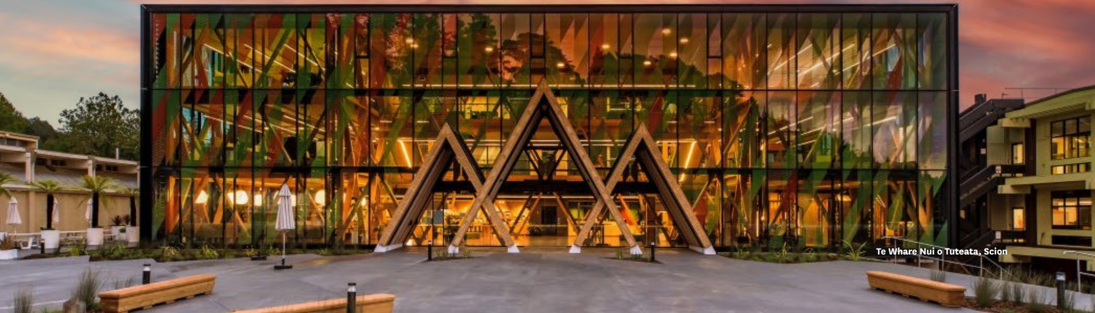
Te Whare Nui o Tuteata, Scion

Scion is a Crown research institute that specialises in research, science and technology development for the forestry, wood product, wood-derived materials, and other biomaterial sectors.