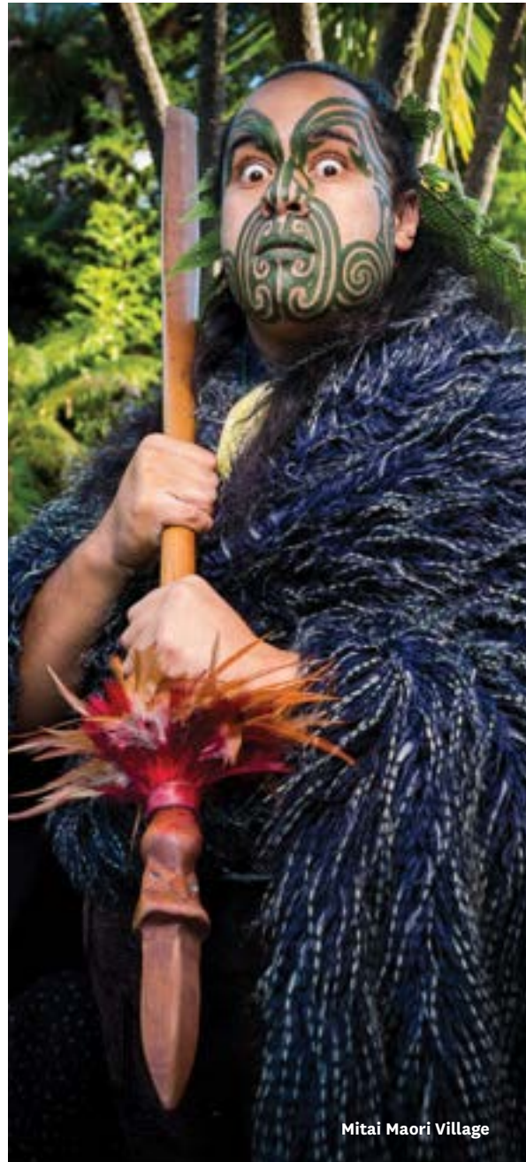
Mitai Maori Village

Discover the real Middle-earth on the most picturesque private farmland near Matamata, in the North Island of New Zealand. During a fascinating two-hour guided tour, visitors can explore the Hobbiton Movie Set, used for The Lord of the Rings and The Hobbit film trilogies. The set has been completely rebuilt and can be seen as it appeared in the films. The Green Dragon Inn is now open and is a special feature of the tours. All tour groups visit the inn as part of their tour and receive a complimentary refreshment.