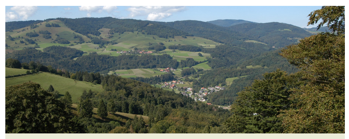
Freiburg is located on the foot of the famous Black Forest mountain range, one of the most important forest regions in Germany.