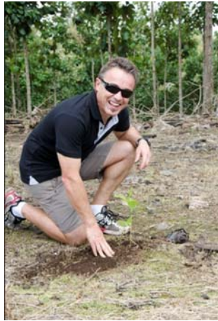
Conference participants planting teak saplings