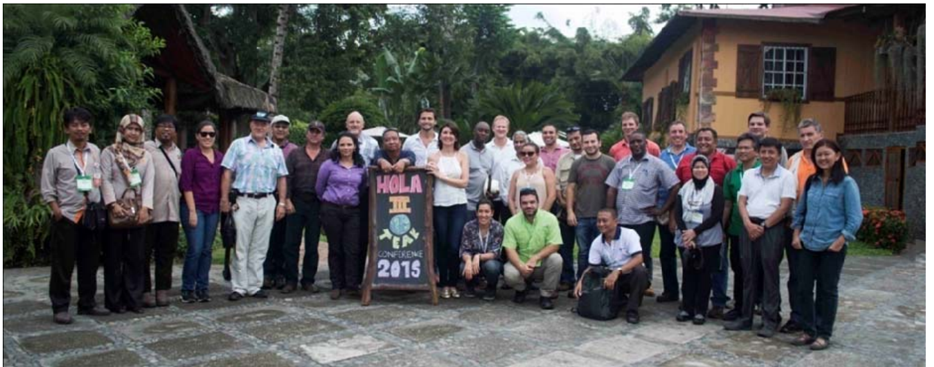
Delegates in the field trip to LA DANESA FARM- Agrotourism farm