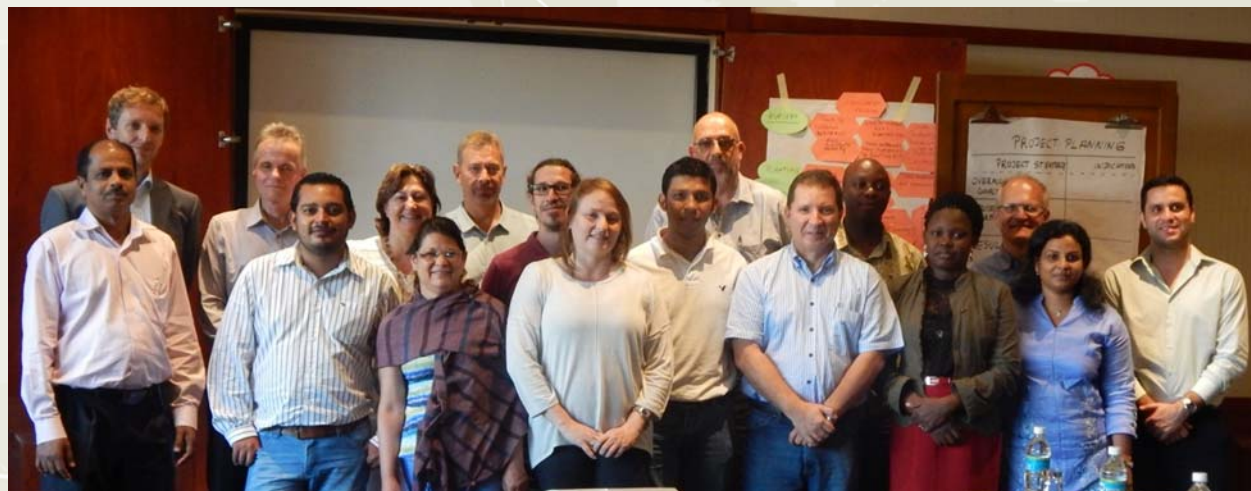
Participants of the Project Formulation Workshop