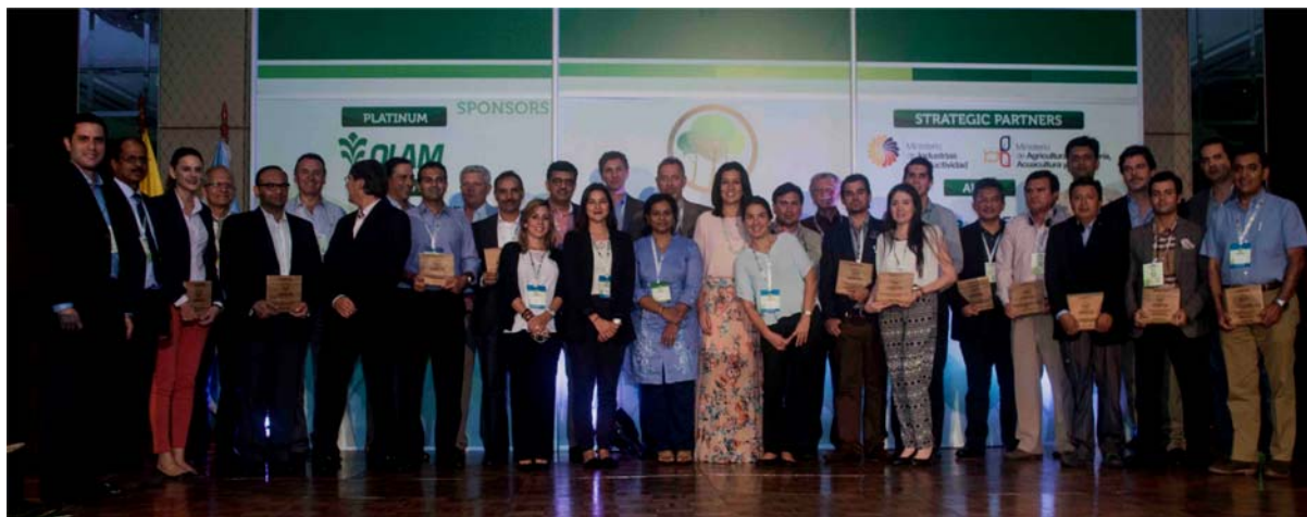
Sponsors and Organizers during the closing ceremony

TEAKNET webpage www.teaknet.org/reports and Conference website www.worldteakconference.com