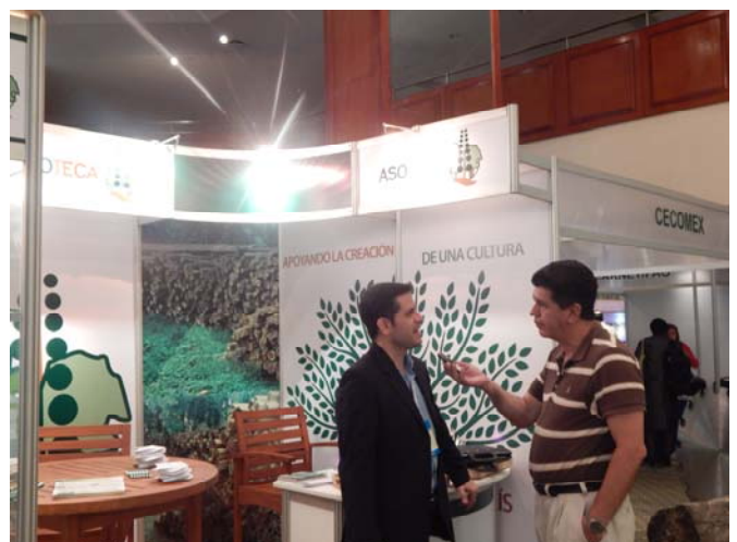
View of Exhibition stands