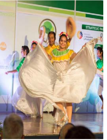
Traditional music and dance performance