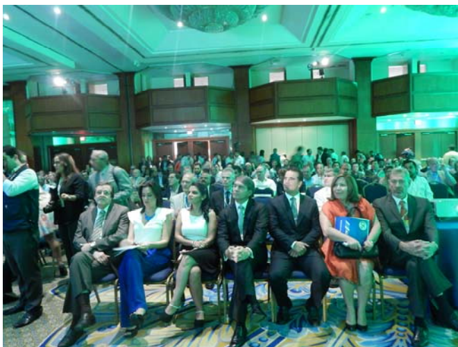
View of the august gathering