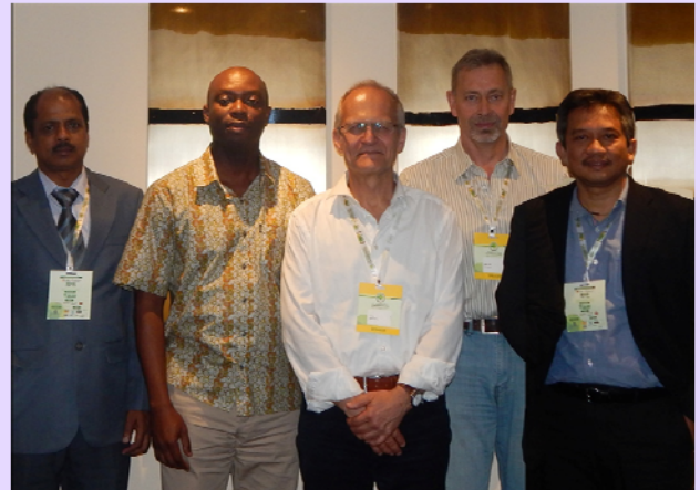
TEAKNET Steering Committee Members during the meeting