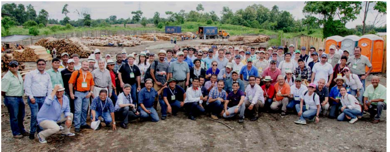
Delegates in the field trip to EL EMPALME- A primary teak log collection and sawmilling center