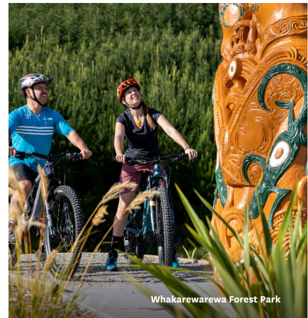
Whakarewarewa Forest Park