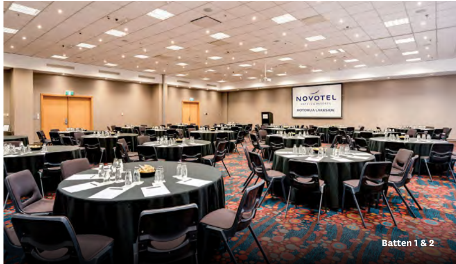
Batten 1 & 2