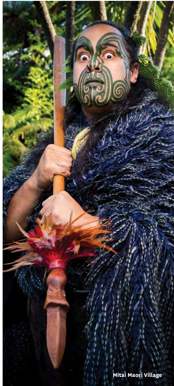
Mitai Maori Village

Discover the real Middle-earth on the most picturesque private farmland near Matamata, in the North Island of New Zealand. During a fascinating two-hour guided tour, visitors can explore the Hobbiton Movie Set, used for The Lord of the Rings and The Hobbit film trilogies. The set has been completely rebuilt and can be seen as it appeared in the films. The Green Dragon Inn is now open and is a special feature of the tours. All tour groups visit the inn as part of their tour and receive a complimentary refreshment.